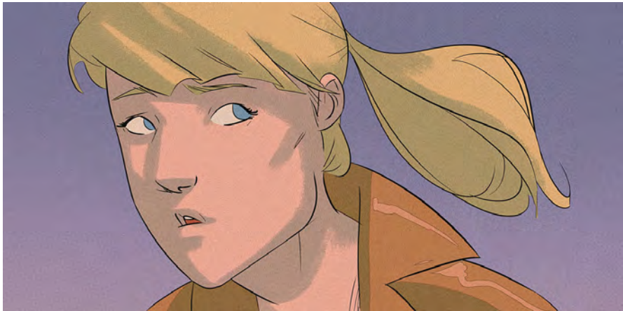
Angela Severson - Image A

Running away costs money, which is why it's easier to do when you grow up rich. For Angela Severson, what happens when something bigger than you occurs and all your escape routes are gone?