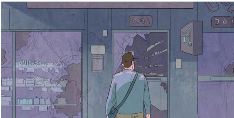
A character pauses before gathering supplies - Image B

A disaster like the 2014 Kaohsiung gas explosions could happen anywhere. Every city has an intersecting maze of pipelines and other subterranean infrastructure. In Kaohsiung's case, an unnoticed leak began detonating just before midnight on July 31st, ripping open entire streets in the process. Taking place on a warm night in a city where night markets are popular, many people got caught out.