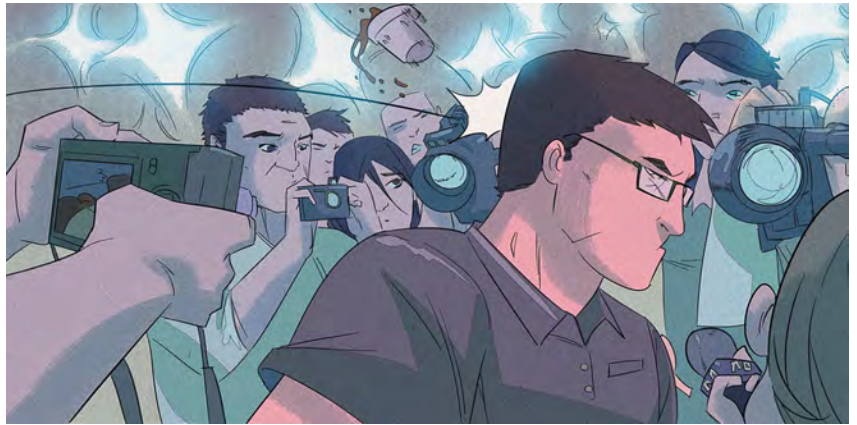
Local industry executives are confronted - Image C

Contact: jason@bystanderchronicles.com info@bystanderchronicles.com