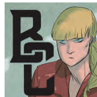
Full Version Icon

Graphic novels are great at communicating history by providing enriching illustrations able to depict any scale, while allowing the reader to progress at their own pace. Digital comics are easily accessible and have been around for the last decade but the overwhelming amount of content available on Netflix-style apps like Comixology can deter lapsed readers. “Most comic books still design for print,” mentions the author, “where elaborate layouts look great but can be awkward on smartphones.”