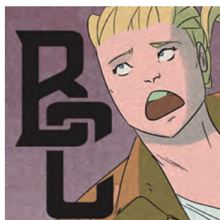
Preview Version Icon

The artwork, illustrated by Megan Huang with colors by BeyondColorlab, was designed specifically to fit as much of the mobile screen as possible without distorting the images. One of the ways to ensure that was to release the graphic novel for iOS and Android, joining a small community of creators trying to sell independently on the app stores.